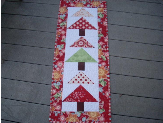
Flutter Christmas Tree runner